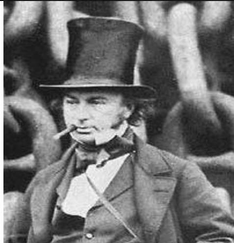
Isambard Kingdom Brunel 1805-1859

He wrote one of the most popular children's books, Treasure Island.