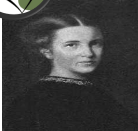
Elizabeth Garrett Anderson 1836-1917

She was the first woman to become a doctor.